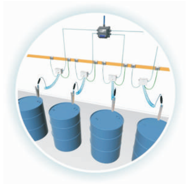
Ideal for Drum Store applications

Between 1 and 4 Bond-Rite REMOTE (EP) units may be powered by a single Intrinsically Safe power supply unit, mounted in a Safe Area, up to 100m away.