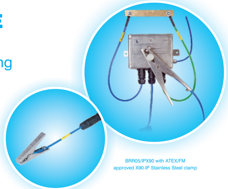
BRR05/IPX90 with ATEX/FM approved X90-IP Stainless Steel clamp

The Intrinsically Safe monitoring electronics, flashing green LED and battery power supply are housed inside a tough, corrosion resistant stainless steel enclosure, designed for wall mounting. This gives the added benefit of protecting the LED in applications where there may be paint splashed, etc. A variety of clamps may be used, depending on the specific needs of the application.