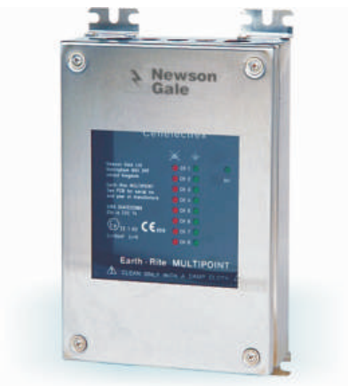
Multipoint Monitoring Unit

In these instances the possibility exists that the removable parts may become isolated conductors if they do not have a sufficiently low resistance path to ground to enable any static generated to safely dissipate. If this happens, high levels of charge may accumulate on the isolated part, posing the risk of energetic static discharges (sparks). If this occurs in a hazardous atmosphere there will be a chance of a resulting fire, explosion or dangerous physiological shocks for operators.